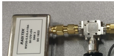
Part of receiver section of radar