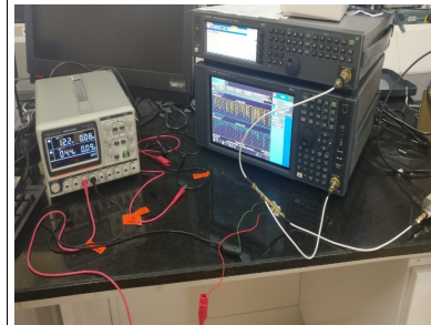
RF test facility